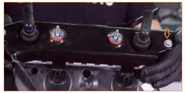
CONTINUED ON FOLLOWING PAGE

37. Remove the two bolts that secure the top of the radiator bracket. (2x 10mm bolts)