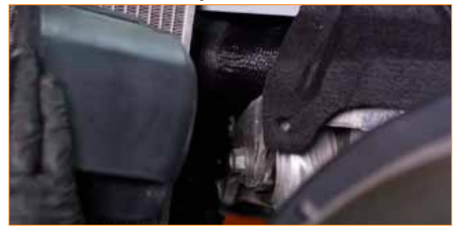
CONTINUED ON FOLLOWING PAGE