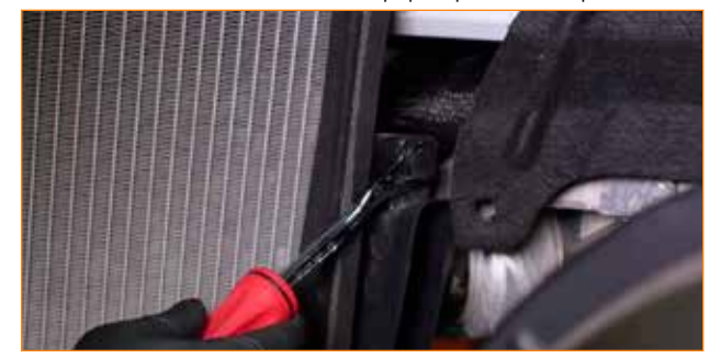
26. Remove the brake cooling duct from the vehicle.

25. Remove the two clips that secure the rear duct to the radiator. Then remove the rear duct. (1x pop-clip, 1x tree clip)