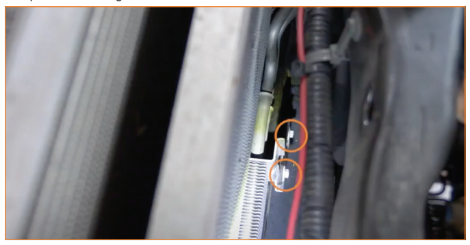
10. Remove the bolts that secure the transmission cooler. (2x 10mm bolts)