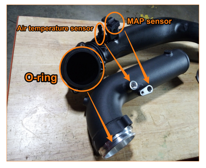
09. Swap the turbo side o-ring and the spring clip to MM2362-01.

08. Swap the MAP sensor using the provided bolt, air temperature sensor, and throttle body side o-ring to MM2362-02. (1x HF6X1.0-20B)