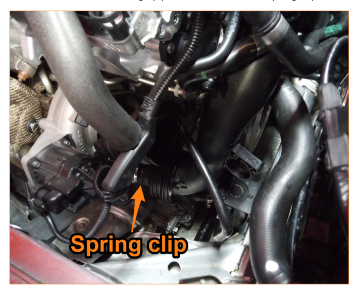
06. Remove the stock charge pipe from the throttle body.(2x T30 Torx bolts)

05. Remove the stock charge pipe from the turbo. (1x spring clip)