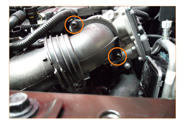
07. Remove the stock charge pipe from the vehicle.

08. Swap the MAP sensor using the provided bolt, air temperature sensor, and throttle body side o-ring to MM2362-02. (1x HF6X1.0-20B)