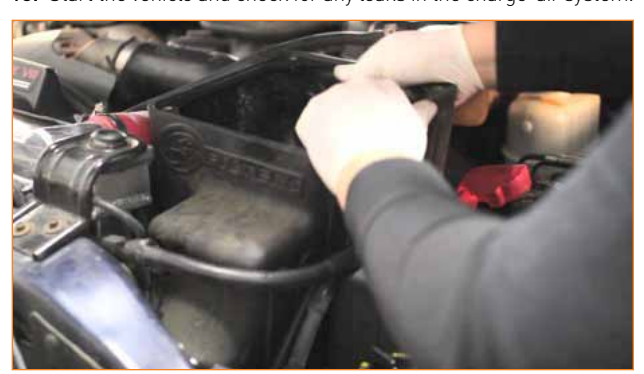
14. You have now successfully installed the Mishimoto Ford 6.0L Powerstroke Intercooler Kit. Enjoy!

13. Start the vehicle and check for any leaks in the charge-air system.