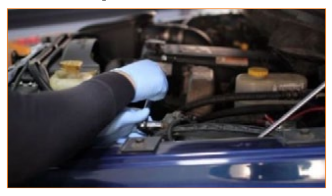
10. You have now successfully installed the Mishimoto Dodge Cummins 6.7L Intercooler Pipe and Boot Kit. Enjoy!