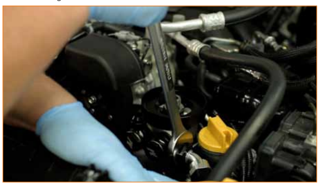
11. Reinstall the oil filter.

10. Install the oil lines onto the sandwich plate. Tighten down all the oil line fittings.