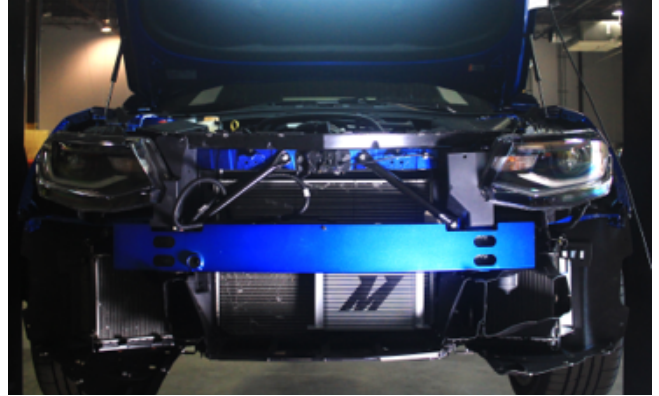
FIGURE 1: The Mishimoto oil cooler was mounted in front of the lower grille opening for optimal airflow.

To combat this limitation, we've placed a Mishimoto 25-row liquid-to-air heat exchanger in front of the lower grille opening of the Camaro (Figure 1).